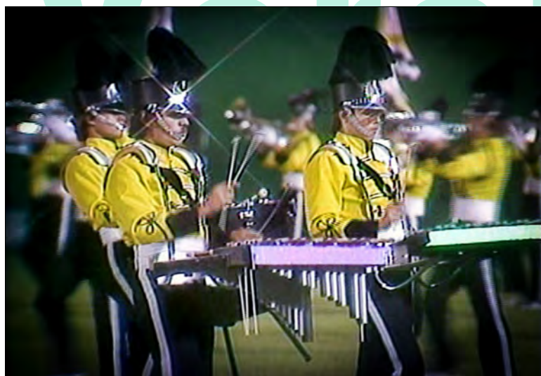
1977: Seneca Optimists (DCI)