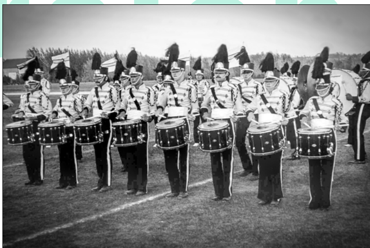
1977: Seneca Optimists snare line