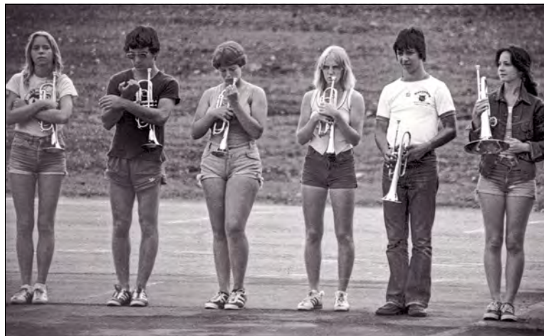
1977: Seneca Optimists rehearsing

Seneca Optimists were eager to go against the new Corps “Northstar”, to see what would happen. What happened was the Seneca Optimists won by nine points, even with a two-point penalty. Their show was shaky, and the concert showed that it had been played for less than two weeks. But a win is a win, and now they only had to go against the Oakland Crusaders, to see where they stood in Canada.