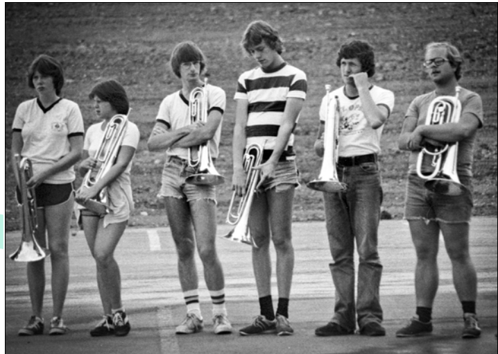
1977: Seneca Optimists rehearsing