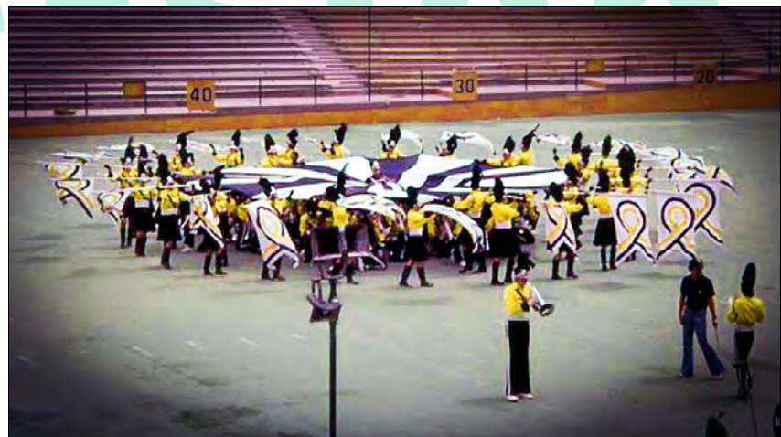
1977: Seneca Optimists “parachute” at DCI prelims

Arriving in plenty of time for a good warm-up, the Seneca Optimists were the first Corps on. After stepping off to what was their best show of the season, chances looked good for the Seneca Optimists. Too good. The score sheets saw them finishing in 9th place overall, lower than expected. However, what’s done is done, and next day was the finals.