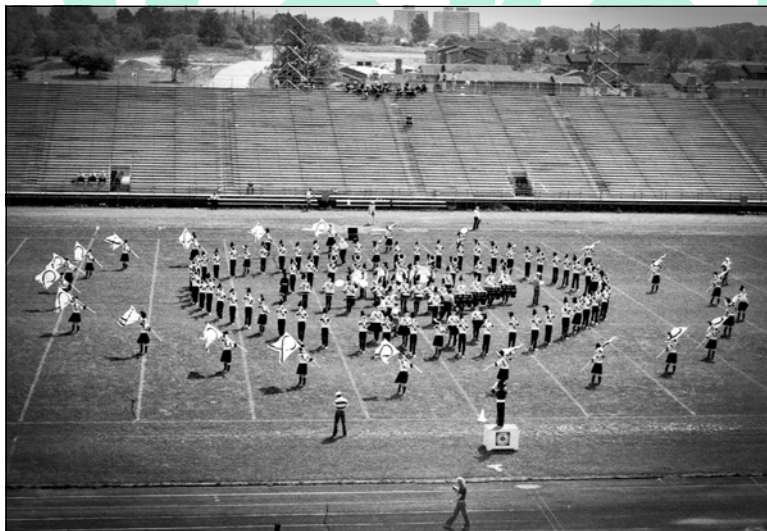
1977: Seneca Optimists

Pulling out all the stops, the Corps performed as never before, doing their best show and to a hometown crowd. The biggest threat was the Oakland Crusaders, the defending champions. Over the course of the year, they had pulled themselves up by the bootstraps but it was not quite enough