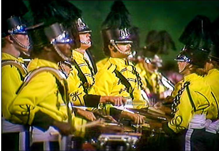
1977: Seneca Optimists (DCI Finals)

Excitement ran high within the Corps, and it grew with the size of the crowd, 30,000 plus, the only crowd of this size on the tour. Applause for the “parachute” number was a thunderous frenzy from a crowd this size. Also, cheering for the Seneca Optimists were the Northstars and the Oakland Crusaders. These two Corps had not made it into the finals. Setting aside any past rivalry, they all cheered lustily for the Seneca Optimists. In a fine display of national unity the Oakland Crusaders displayed a Canadian flag.