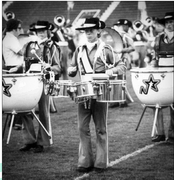
1977: Northstar from Kitchener

Across town, the Oakland Crusaders reportedly also had a full 128-member Corps. A difference was that they had had a big turnover, and many of these people were new.