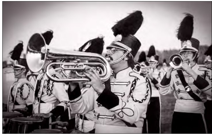
1977: Seneca Optimists

In the class "A" division, as opposed to the "Open" division, the Cardinals of Precious Blood won the title. They were from Scarborough, Ontario, so it was a great day for Canadian Drum Corps.