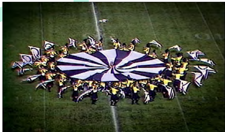
1977: Seneca Optimists Parachute (DCI Finals)

A very un-D.C.I. like spectacle followed. Disorganized and, at first, for the Seneca Optimists, disappointing. They tied for eight place with the Capitol Freelancers, with a score of 82.40. Disappointing because the Corps had set out this year with aspirations to a higher standing. Later, though, it was decided that this was an accomplishment. It was. Eighth best in the world, against more experienced units, and only in their second year. De La Salle and Oakland Crusaders, one and the same really, had placed higher at earlier finals, but, nevertheless, it was still a major feat. Just to enter the top twelve was. Many dozens tried. Eventual recognition of what they had done made all the time, work, and pains seem worthwhile. Very few Corps achieved this. They had done their best and had reason to be proud. Looked at from a different viewpoint, out of 4-5 billion people in the world, they were now in the top 1,152 in their field.