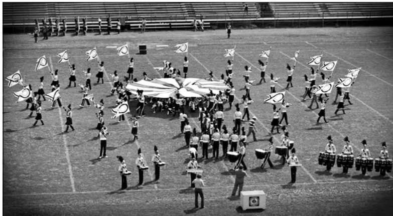
1977: Seneca Optimists exiting “Parachute”