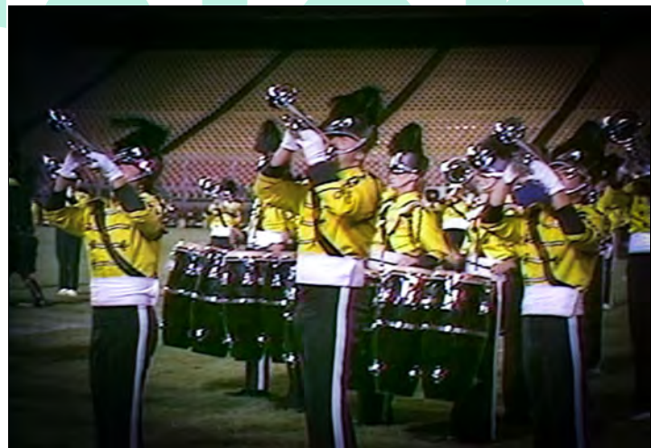
1977: Seneca Optimists (DCI)