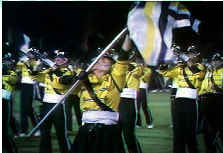
1977: Seneca Optimists (DCI Finals)

After a noon hour rehearsal at Keating Park, delayed due to a late equipment truck, the Corps reassembled at Seneca College. From there, it was onto the buses and heading westward to Ypsilanti, Michigan. The 1977 D.C.I. tour was underway.