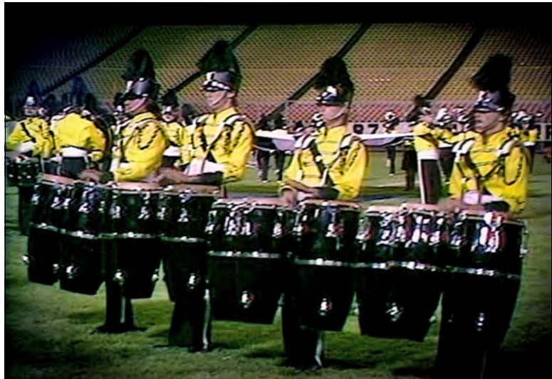
1977: Seneca Optimists congas (DCI Finals)

The return trip was interesting with breakfast in Glenwood Canyon, beside the Colorado River, some mountain climbing, and collecting rock samples for the folks at home. The busses picked up some members of Northstar, whose bus had broken down. Finally reaching Denver, the Corps continued east to Greeley, Colorado.