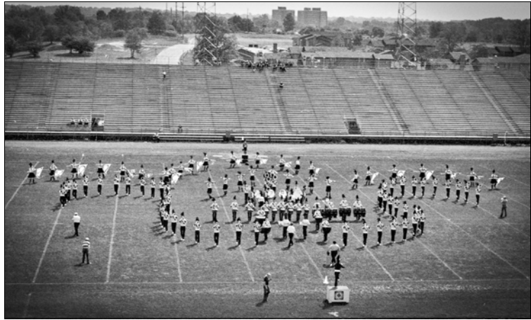
1977: Seneca Optimists

Now, in Port Dover, Ontario, on the warm shores of Lake Erie, was the second Corps camp. Other Corps were there too, and all put on an exhibition for the townsfolk. “Ventures”, the fine Girls’ Corps, made breakfast for the Seneca Corps