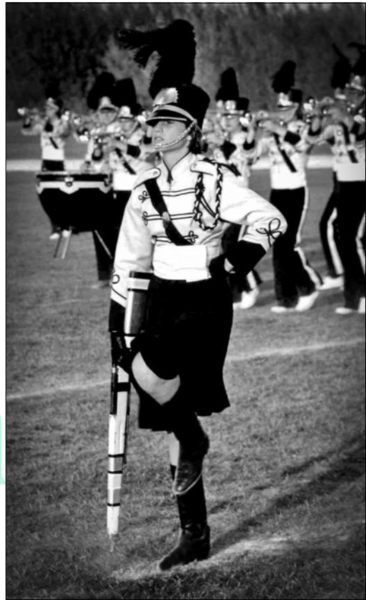
1977: Seneca Optimists

thought that we were in the Rockies, but actually were only in the foothills. On this trip, we had a glimpse of the real Rockies, and they were awesome to us dudes. Through Glenwood Springs to the mining town of Carbondale. “Drums Along the Rockies” saw the Seneca Optimists put on a good performance, placing four points behind Santa Clara Vanguard. This was good for this Corps. After a dip in the local “Hot Springs” courtesy of free passes from the contest sponsor, it was back through the mountains to Denver.