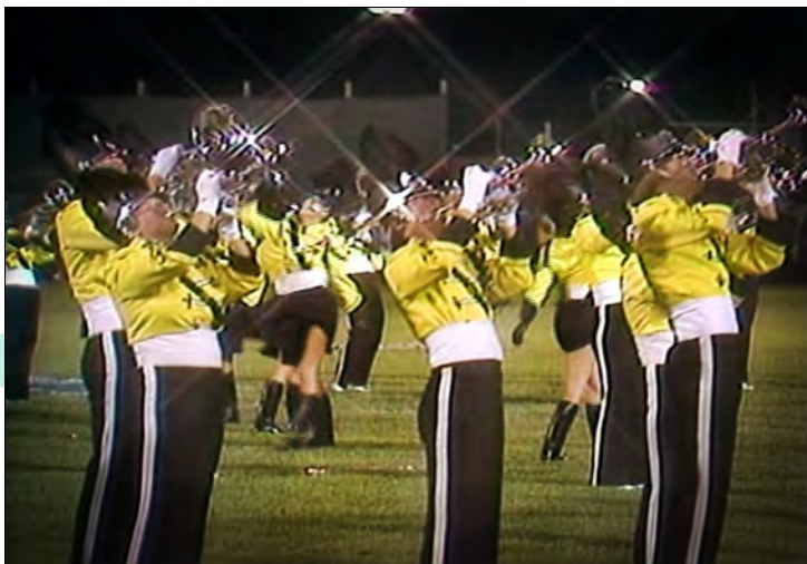
1977: Seneca Optimists (DCI Finals)