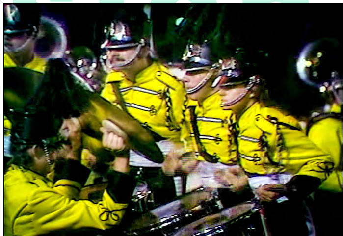
1977: Seneca Optimists (DCI)