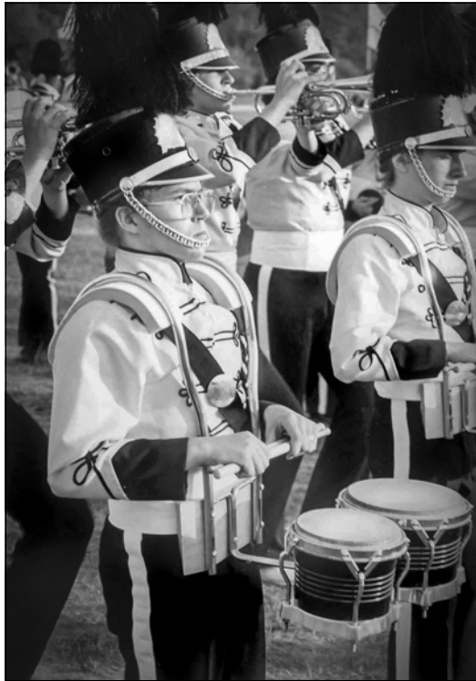
1977: Seneca Optimists

It was here that it was noted that the Crusaders drum line had beaten those of all the D.C.I. Corps that they had met.