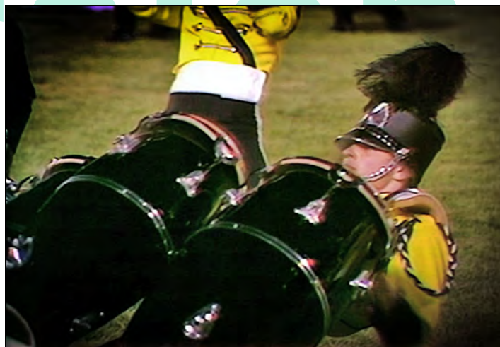
1977: Seneca Optimists Conga (DCI)

Seneca wins, already starting to come together, doing the type of show one would expect from a D.C.I. Corps. The next week it was a two-stop trip to the United States. For the first time this year, the competition included the Oakland Crusaders. This Corps had suffered a large turnover in personnel, and it showed. Seneca Optimists were second, two points behind Garfield, and, unheard of before, twelve points up on the Oakland Crusaders. The “Oakies” scored high drums. Their drum line was superb. Everybody could see that. Next day, it was Waverly, N.Y. and, again, a second place to Garfield. The score for our Corps was in the 67-68 range. Back in