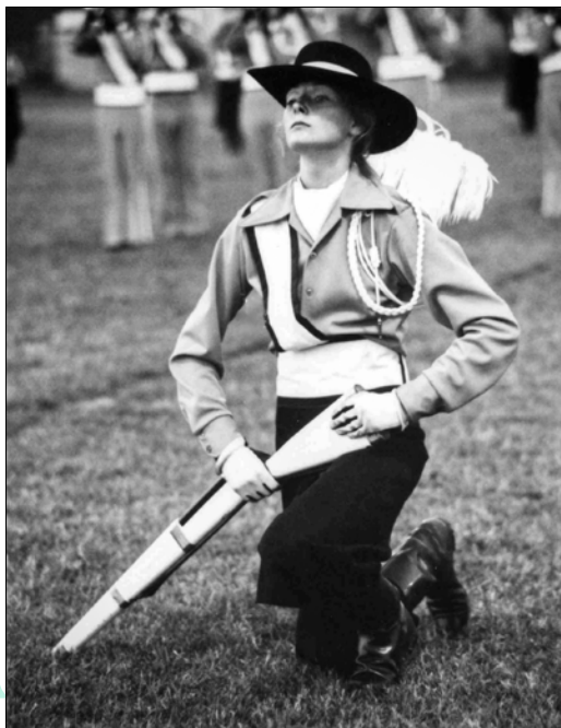
1977: Northstar Rifle

The same placings, and almost the same scores, occurred on July 15th in Toronto. This was the show sponsored by Seneca College, and marked the return of D.C.I. to Toronto, after a three-year absence. Again, with Madison first and Phantom second, Seneca Optimists were third, 2.8 out of top spot. This was, for this Corps, a period of new highs. Oakland Crusaders, with only 109 people on the field, were still having their problems. Still, although in fifth place with 67.55, and almost eleven behind Seneca, they captured the top drum score. This would happen all year, against all the best. The “parachute”, playing to new faces wherever it went, was partly responsible for the standing ovation received by the Seneca Optimists. Their concert of “West Side Story” was being compared to that of the Madison Scouts. Things, during this period, looked very rosy for this Corps. This early, on July 15th, it looked as if they could go a long way. They would, but a flaw was to appear later that would slow things down a bit.