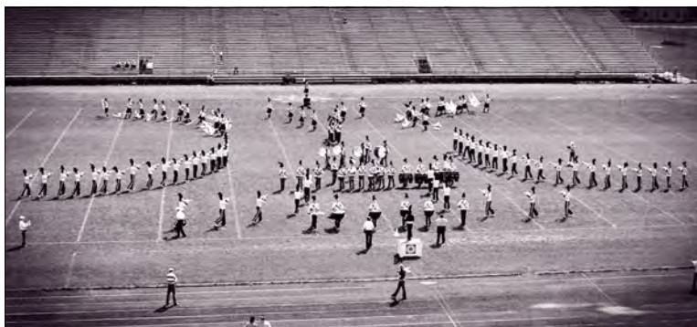
1977: Seneca Optimists

Drill rehearsals began in January. The double gym at Seneca College was large enough for the whole Corps to learn and practice parts of the 1977 drill. Later, it could all be put together outside.