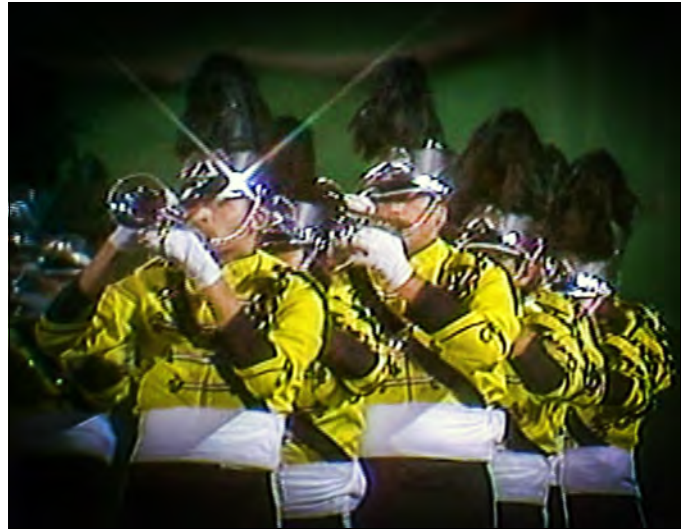
1977: Seneca Optimists (DCI Finals)

The guard bus and drum bus dashed straight for home, while the horn bus took its time, stopping at a McDonalds in Michigan. The equipment truck was stopped at the border, it, and its entire contents, being confiscated in the name of the Government of Canada. The Corps, as of now, ceased to exist. Some phone calls to Toronto, and back, cleared up the misunderstanding and the truck proceeded on its merry way, the Corps now being back in business. All agreed that the C.N. Tower was a sight for sore eyes.