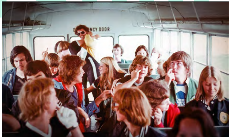
1977: Seneca Optimists members on a bus